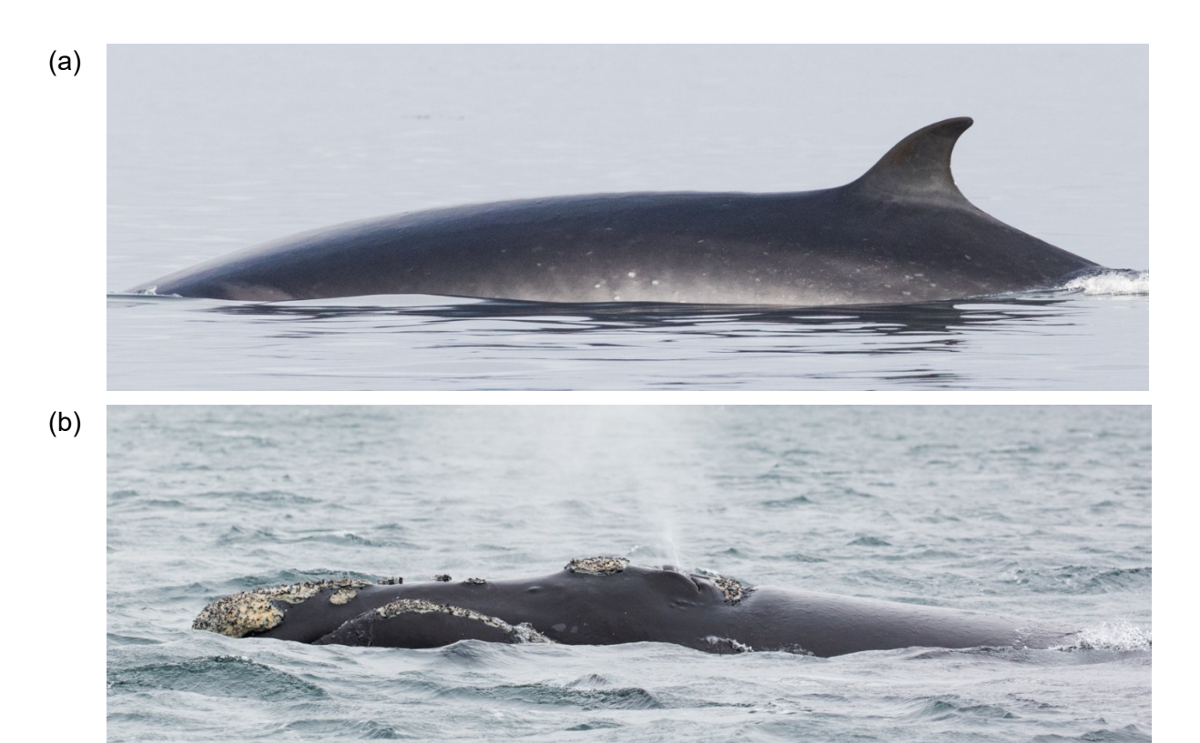
Figure 1. Project study species in the Falkland Islands: (a) sei whale and (b) southern right whale.

The project, led by Falklands Conservation (FC), uses a multi-disciplinary approach to collect the key information relevant to achieving practical management and spatial conservation measures for baleen whales in the Falkland Islands. The approach includes: